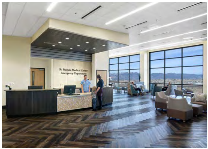
RTA Architects and Time Frame Images The waiting room at the new St. Francis Medical Center ED features natural daylight and mountain views.

were also evaluated. As a result, the team determined a splitflow model, utilizing an intake process to assign a patient's Emergency Severity Index, would be a key design element.