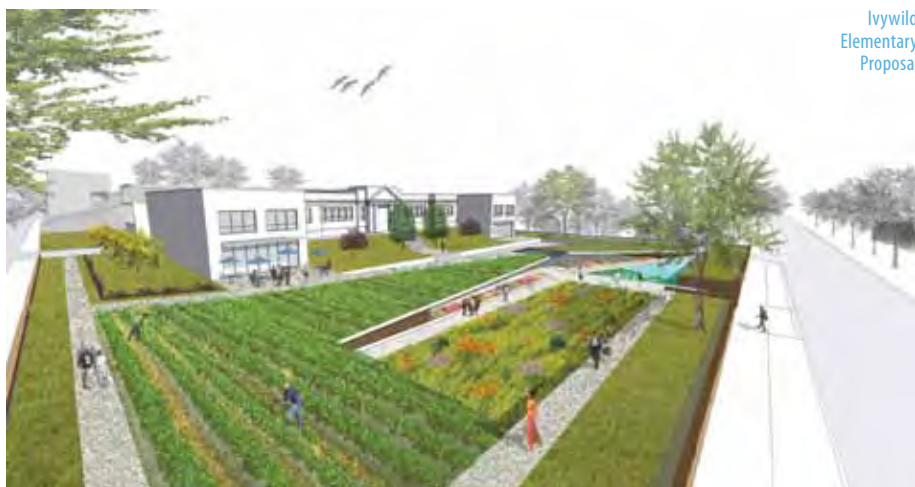
Ivywild Elementary Proposal

Brown used his boards to hone in on the neglect of downtown, suggesting mixed use, an extension to the library and a shared research facility for the city’s three universities. “For a healthy city, Colorado Springs needs to refocus efforts downtown so we can have less of an impact on the environment and update our existing infrastructure, to do all the things that are going to create a 21st-century city — light rail and greenways and parks and pedestrian access,” Brown says.