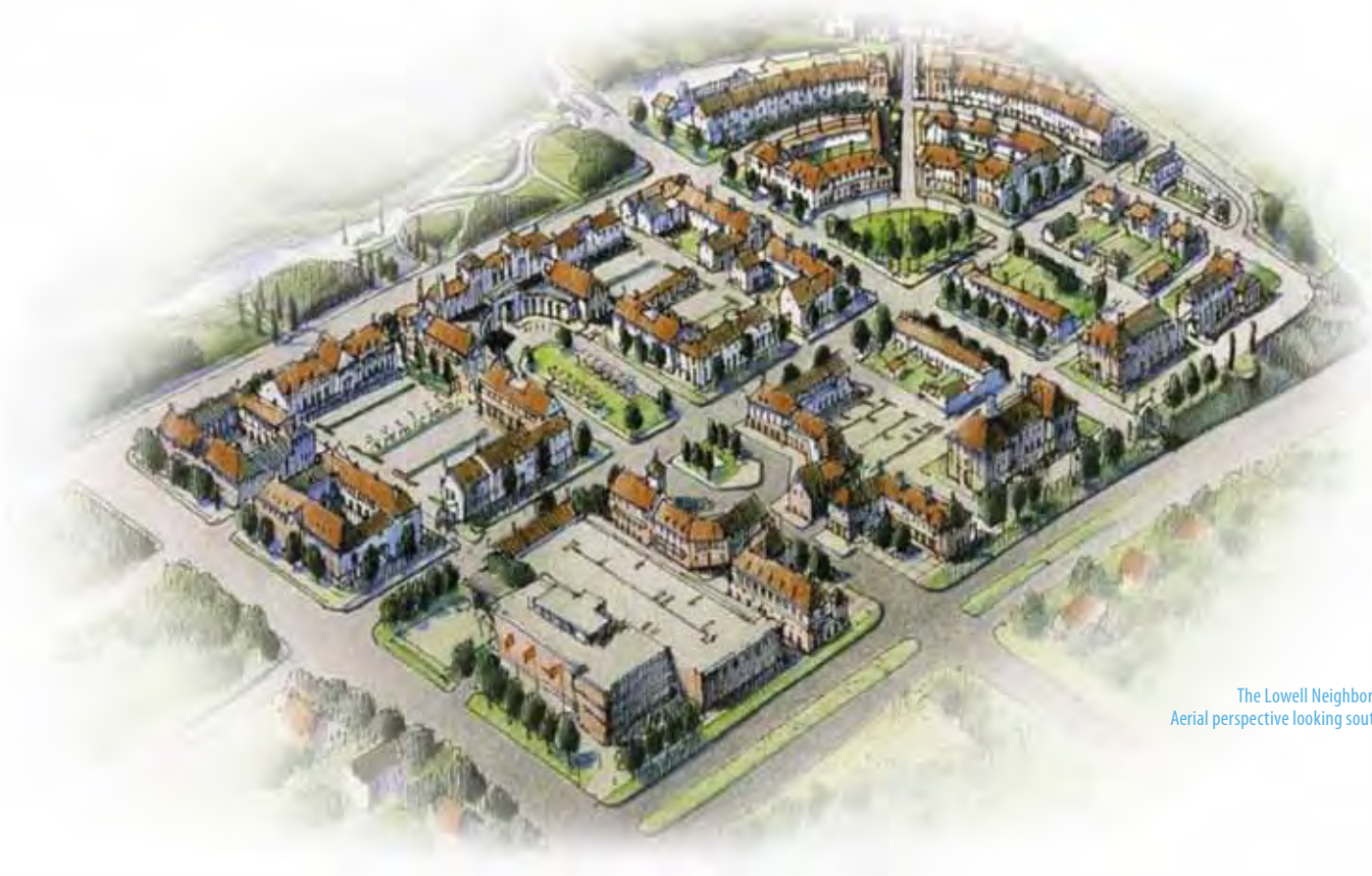
The Lowell Neighborhood, Aerial perspective looking southeast

about how to deal with the concepts of what a city is.”